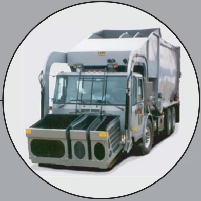
Two or Three Compartments

Available with IQAN computerized leveling system option for fully automatic loading!