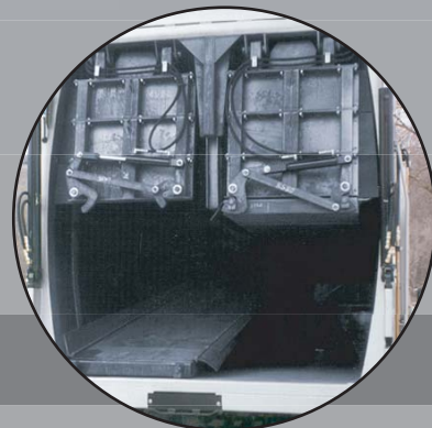
Patented Horizontal Drop Floor With Variable Volume Adjustable Bulkhead Feature

Tel (563) 252 2035 Fax (563) 252 3069 E-mail sales@kannmfg.com Web www.kannmfg.com