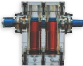
Patented Thinline® Rack and Pinion Rotary Actuator