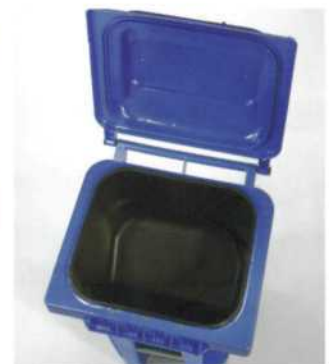
20 gallon insert in 35 gallon container for collection of recyclables

SSI SCHAEFER SYSTEMS INTERNATIONAL, INC.