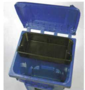
5 gallon insert in 65 gallon container for recycling glass